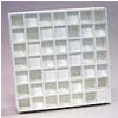
2-D Quadratic Residue Diffuser (QRD)

Examples of other types of sound diffusers that have recently been developed: