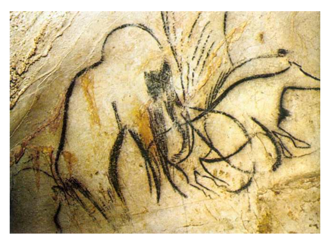
Figure 8: A photo of another drawing of a mammoth and a horse at Grotte du Pech Merle.