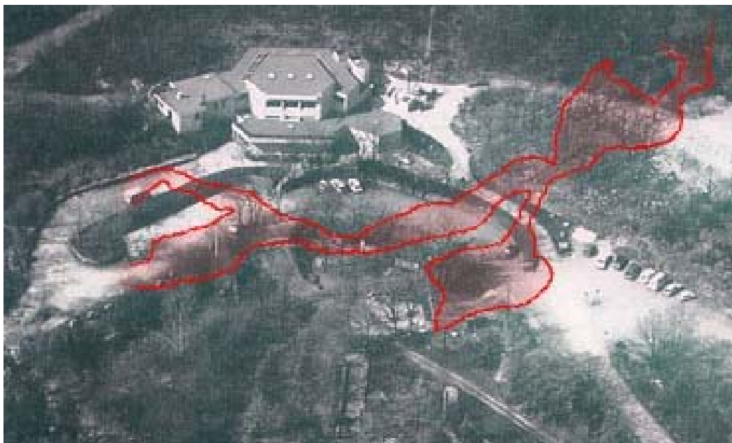
Figure 4: Photo of the surface of the Pech Merle site with superimposed plan of the cave.