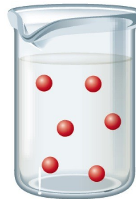
Solution B Volume = 4.0 L