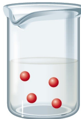
Solution C Volume = 2.0 L